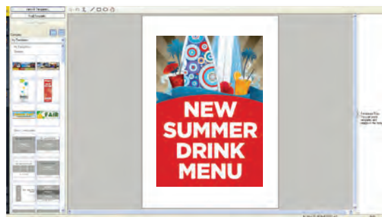
PosterArtist poster creation software